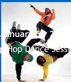
January Hip Hop Dance Sessions